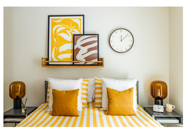
KING-SIZED BED & BED SIDE TABLE