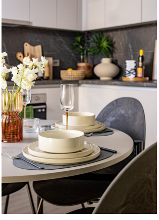
DINING TABLE & CHAIRS