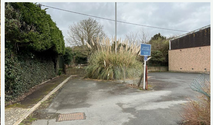
Land Adjoining The Old House, Brighstone, Isle of Wight PO30 4AJ