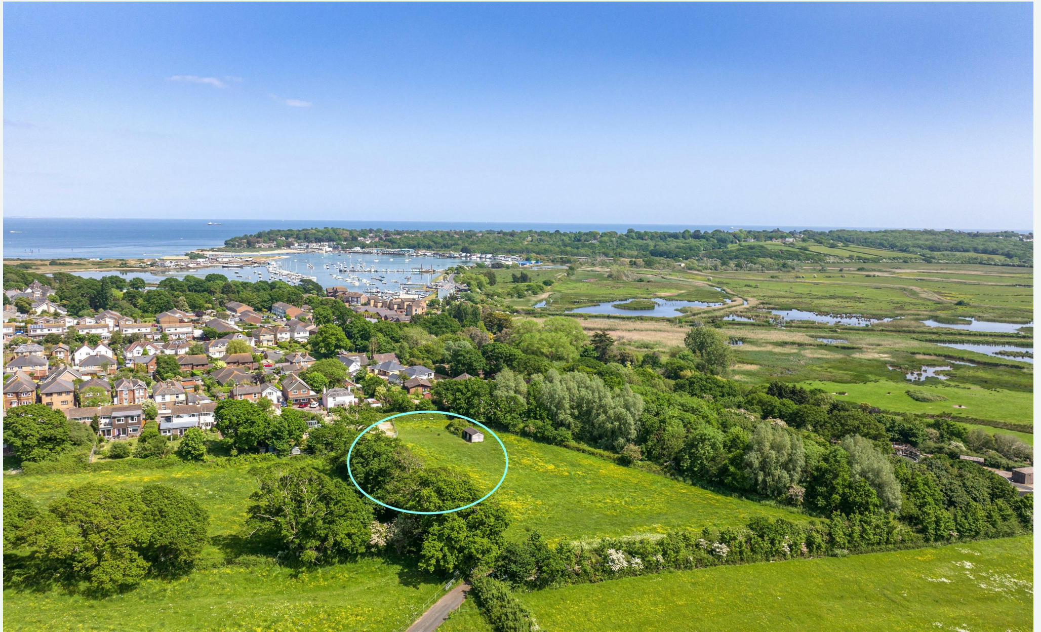
The Paddocks St. Michaels Road, St. Helens, Isle of Wight, PO33 1YJ