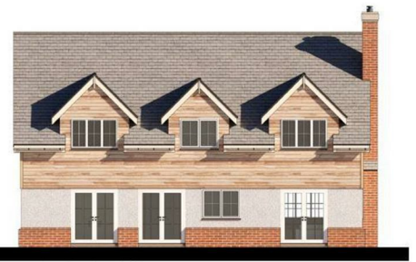
Proposed West Elevation 1:100