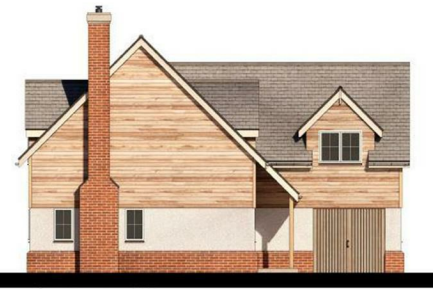
Proposed South Elevation 1:100