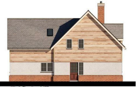
Proposed North Elevation 1:100