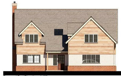
Proposed East Elevation 1:100

SKETCH PLAN FOR ILLUSTRATIVE PURPOSES ONLY All measurements walls, doors, windows, fittings and appliances, their sizes and locations, are approximate only. They cannot be regarded as being a representation by the seller, nor their agent. Produced by Potterplans Ltd. 2023