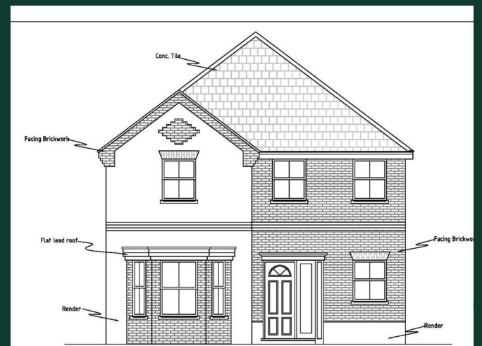
Front Elevation Scale 1:50@ A1