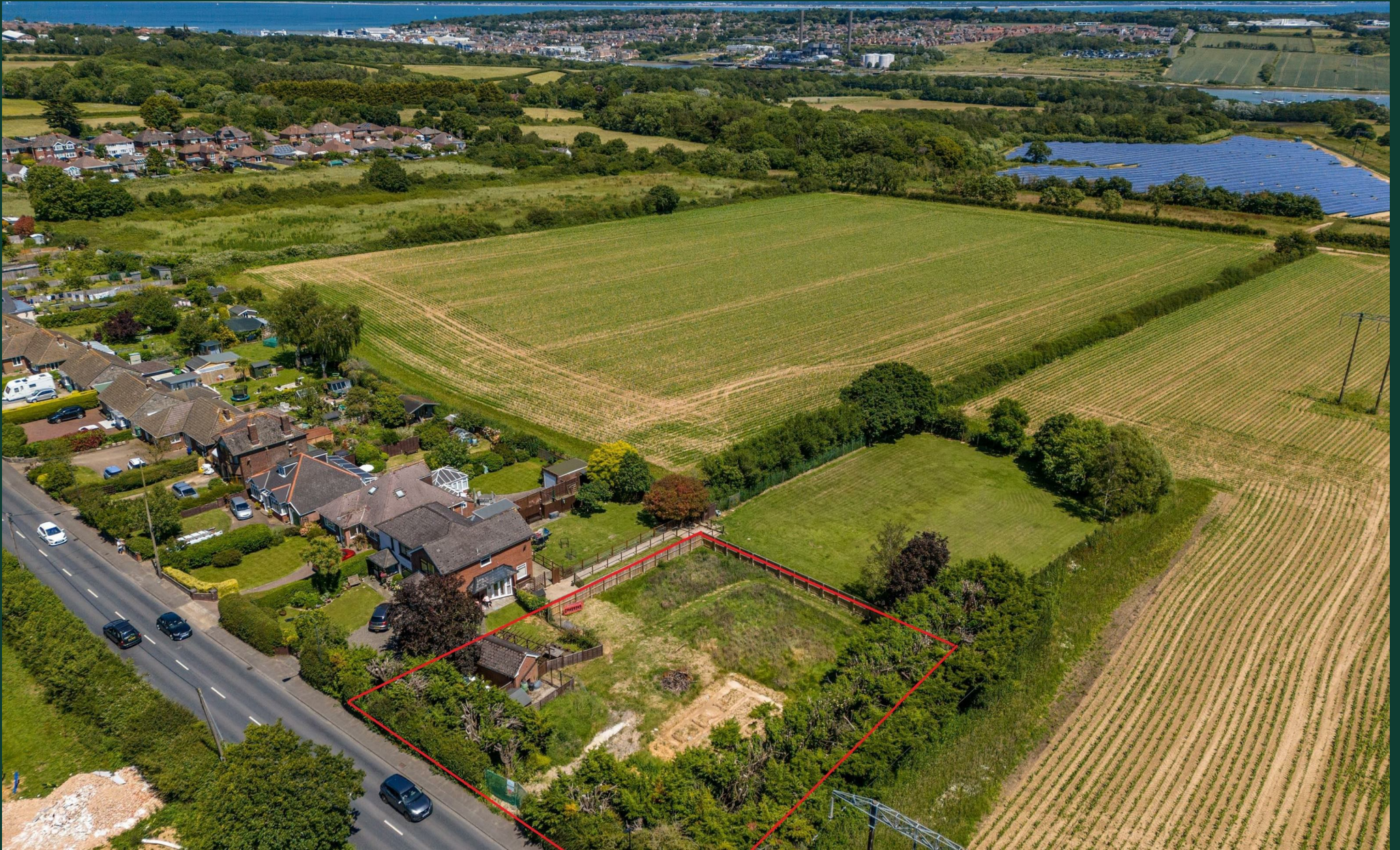
Plot adjacent to, 424, Newport Road, Cowes, Isle Of Wight