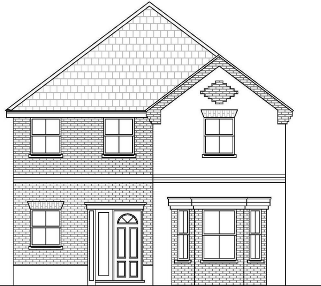
Front Elevation Scale 1:50@ A1