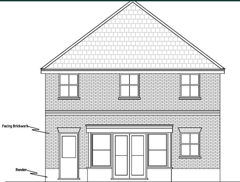
Rear Elevation Scale 1:50@ A1