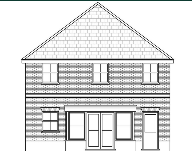
Rear Elevation Scale 1:50@ A1