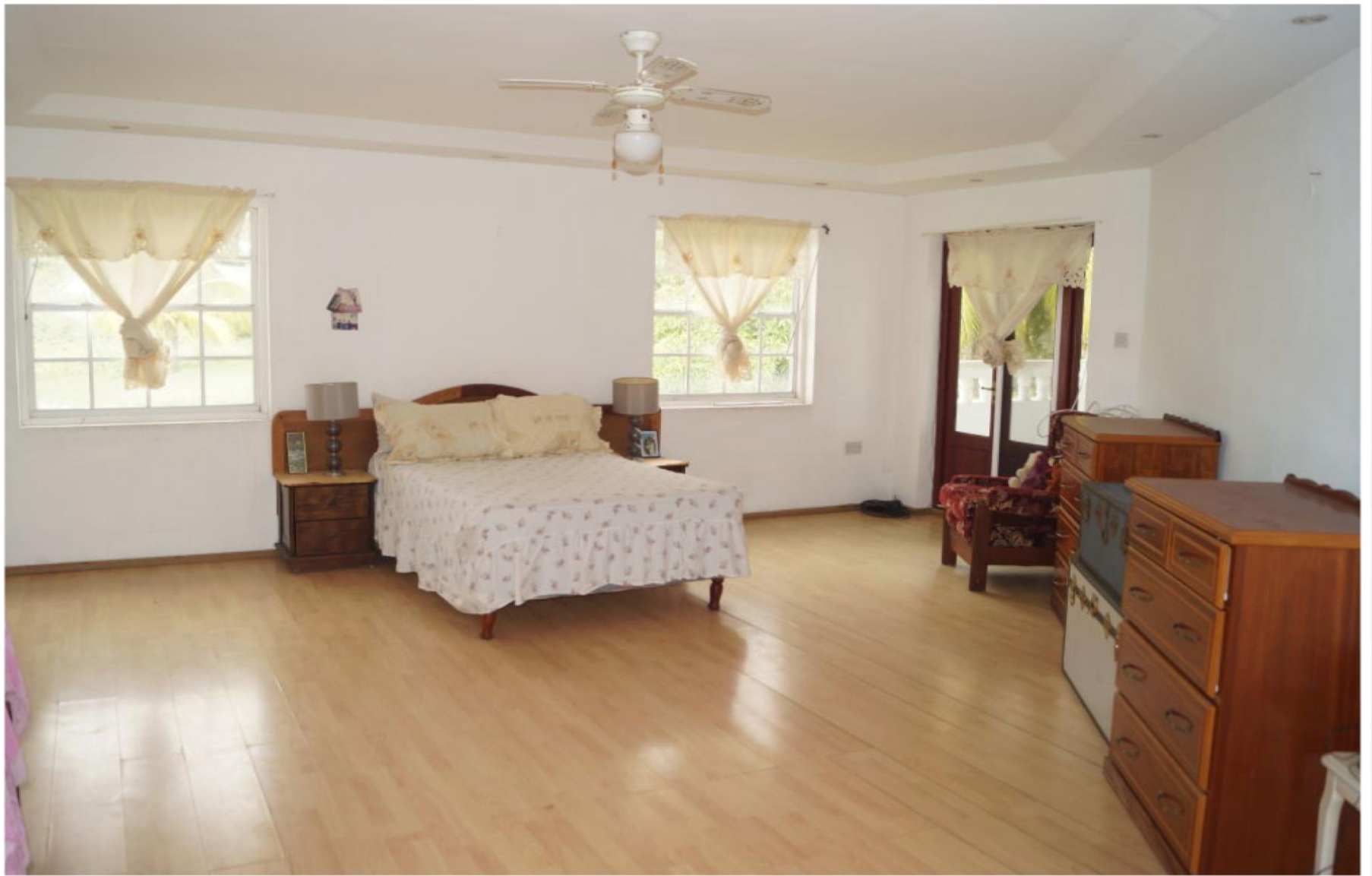
A really large master suite with double French doors to its own private balcony. A walk-in clothes closet and ensuite bath with separate shower stall and bidet completes the suite.