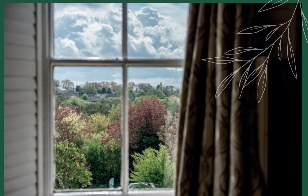
"We wake up to birdsong and the first light touching the hills - it feels like the world is ours alone."