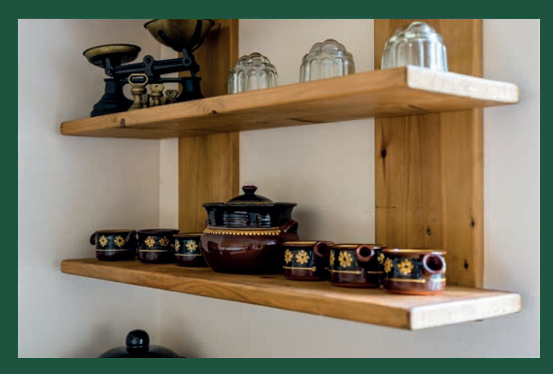
"I love baking here on Sunday mornings - the smell of coffee and fresh bread fills the whole house."