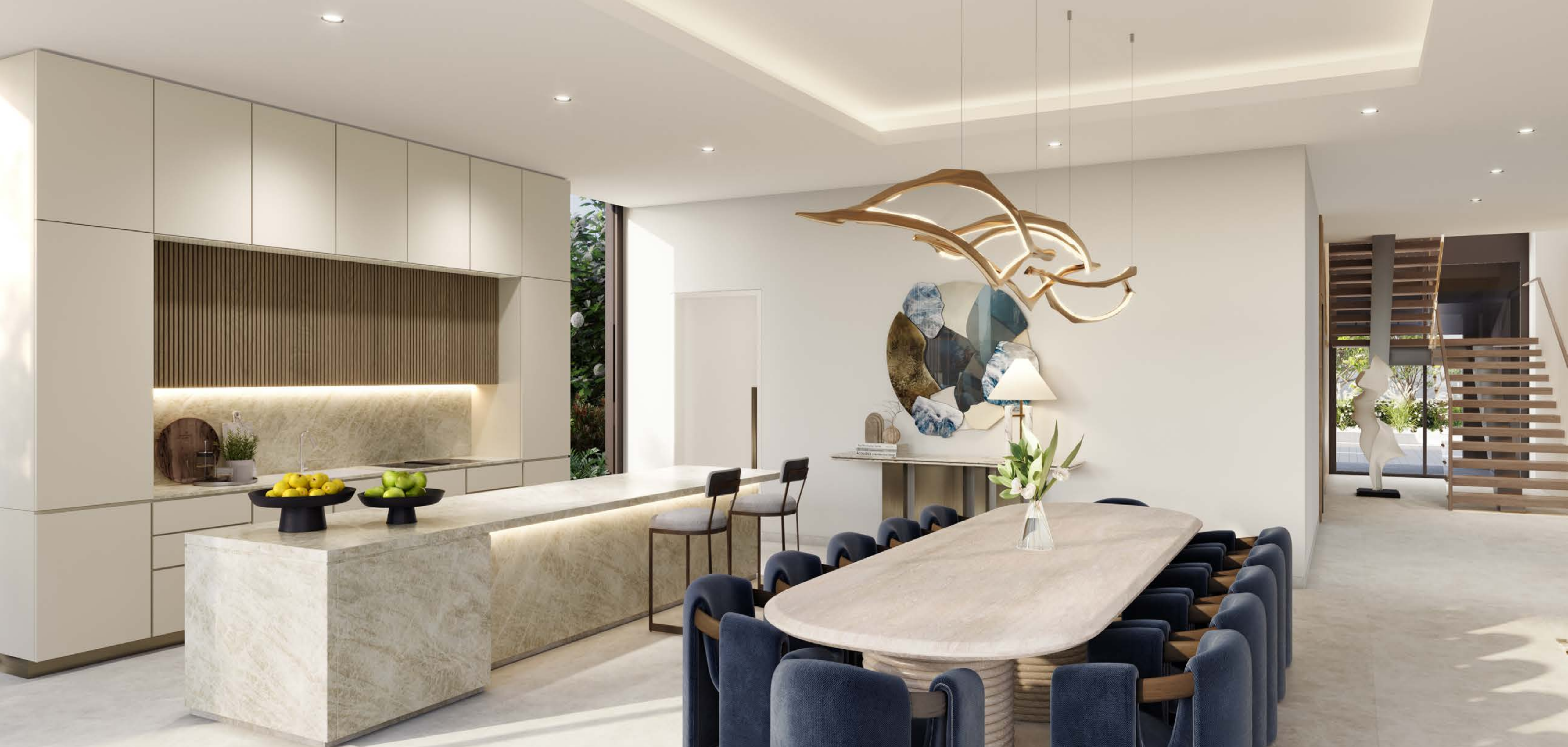
7-BEDROOM VILLA | KITCHEN & DINING