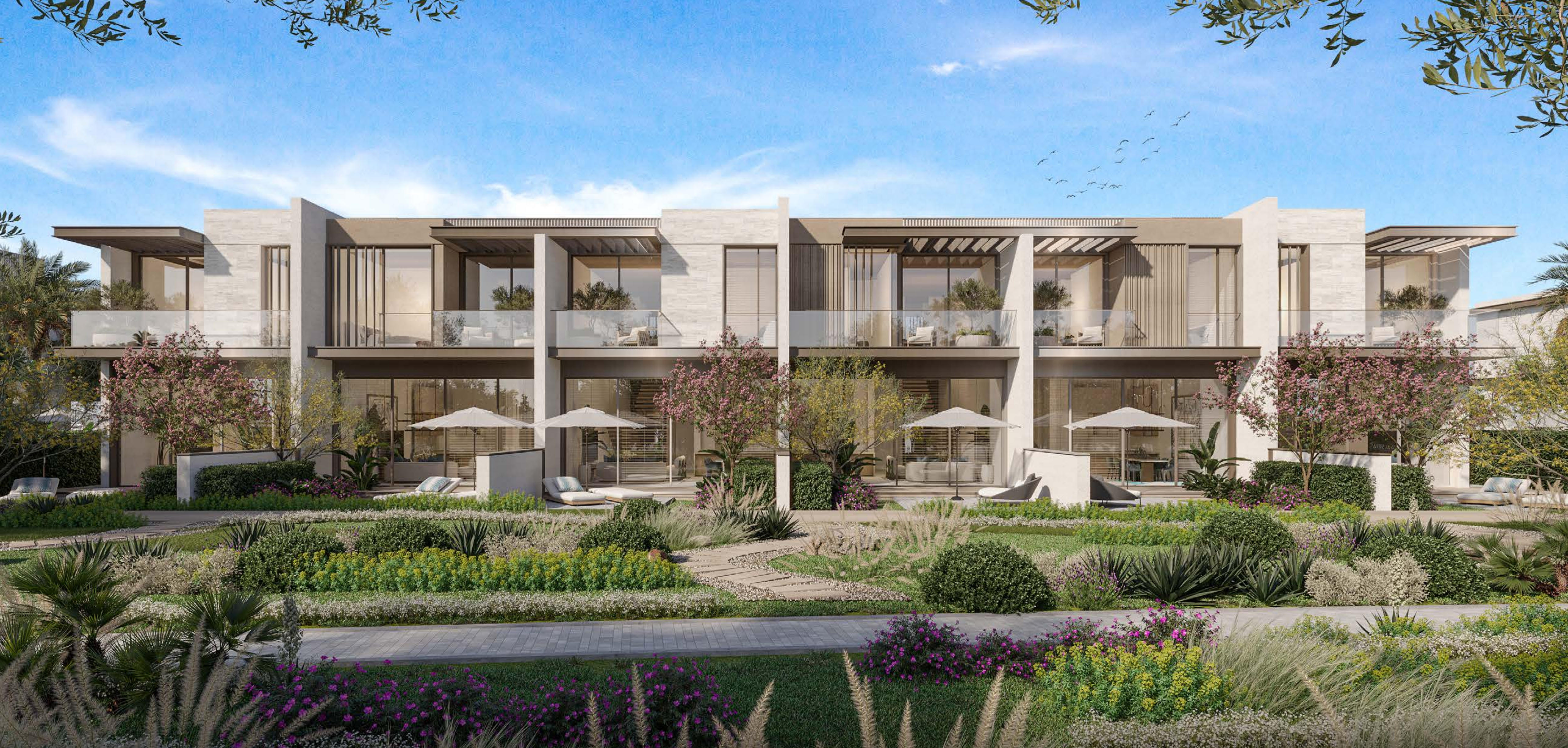
3-BEDROOM TOWNHOUSE | G+1 | 6PLEX