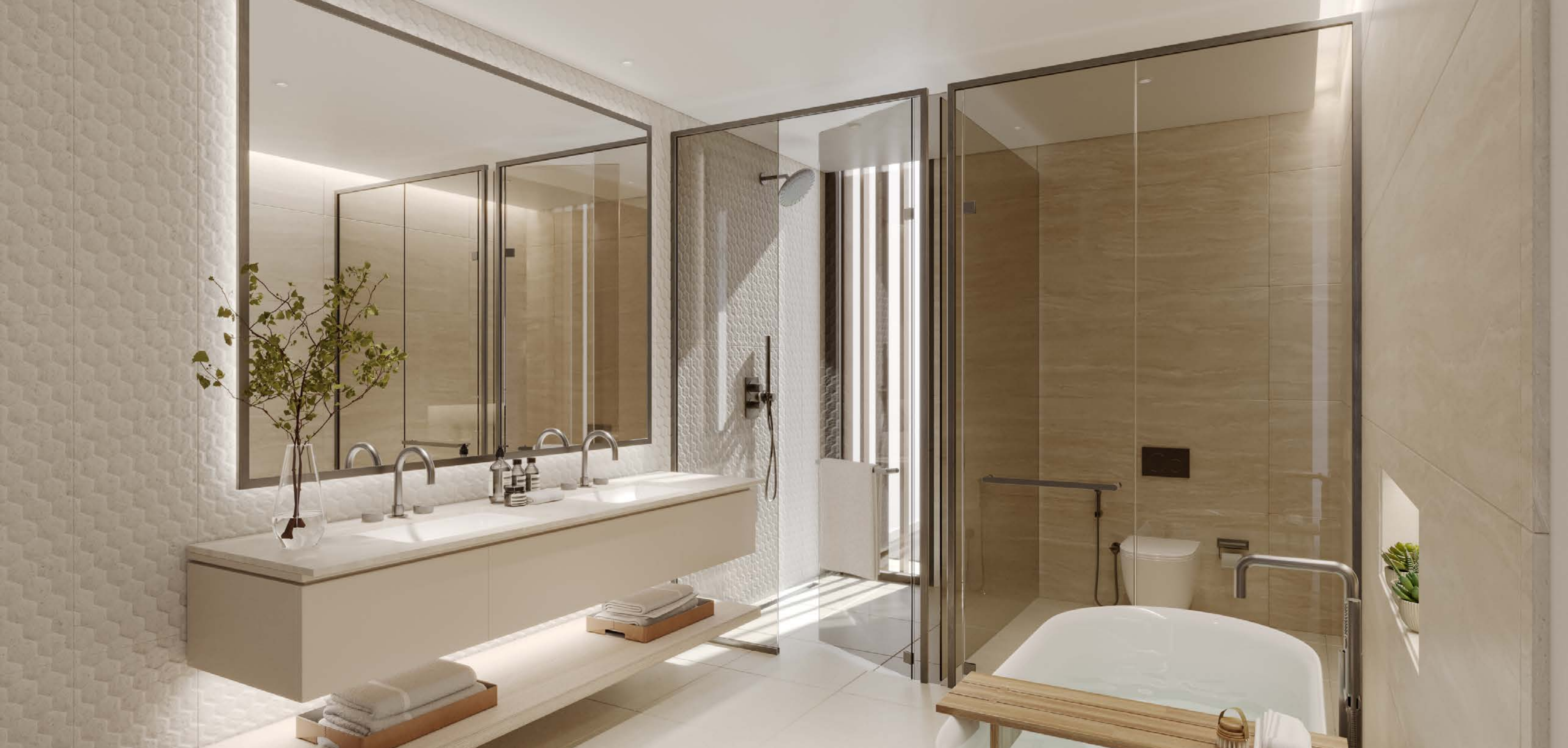
3-BEDROOM TOWNHOUSE | BATHROOM