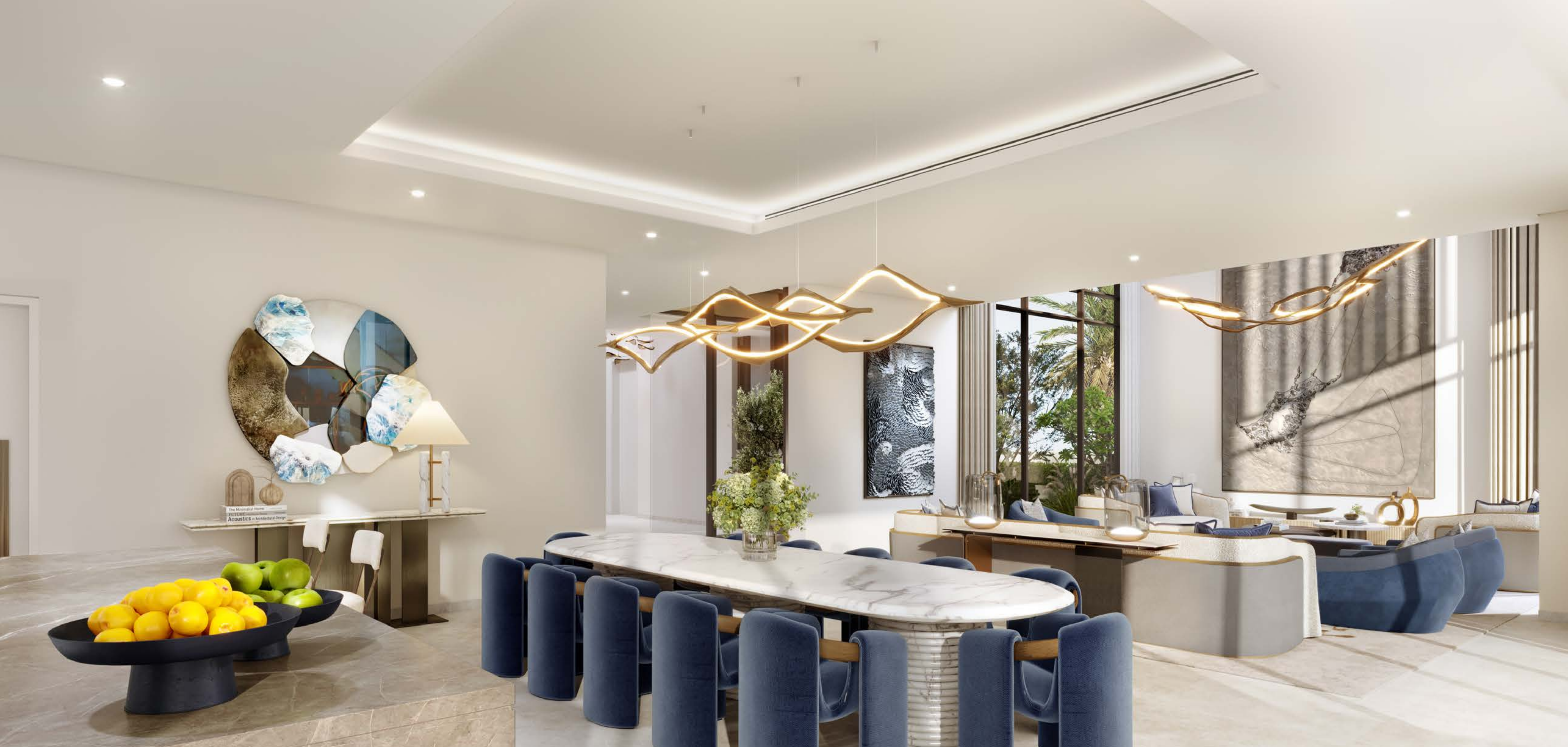
7-BEDROOM VILLA | LIVING & DINING