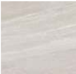
Faience Museum Mainstone Cloud Mat