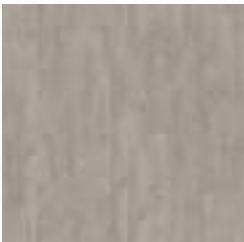
Parquet Grey Ashwood