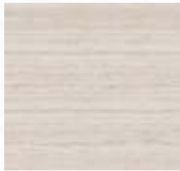
Travertino Pearl Porcelain