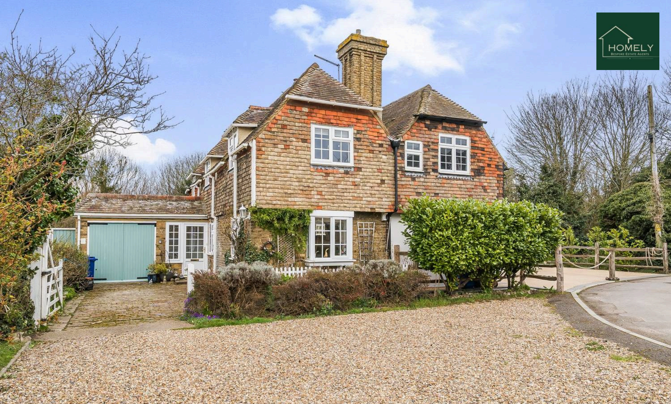
Cryalls Farm Cottage Cryalls Lane, Sittingbourne Sittingbourne