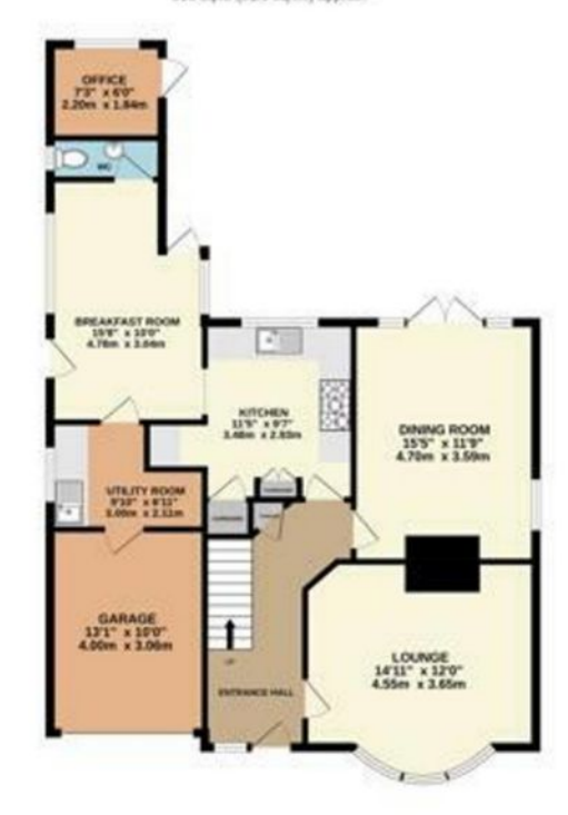
15T FLOOR 717 og ft. (66.6 sq m.) approx.