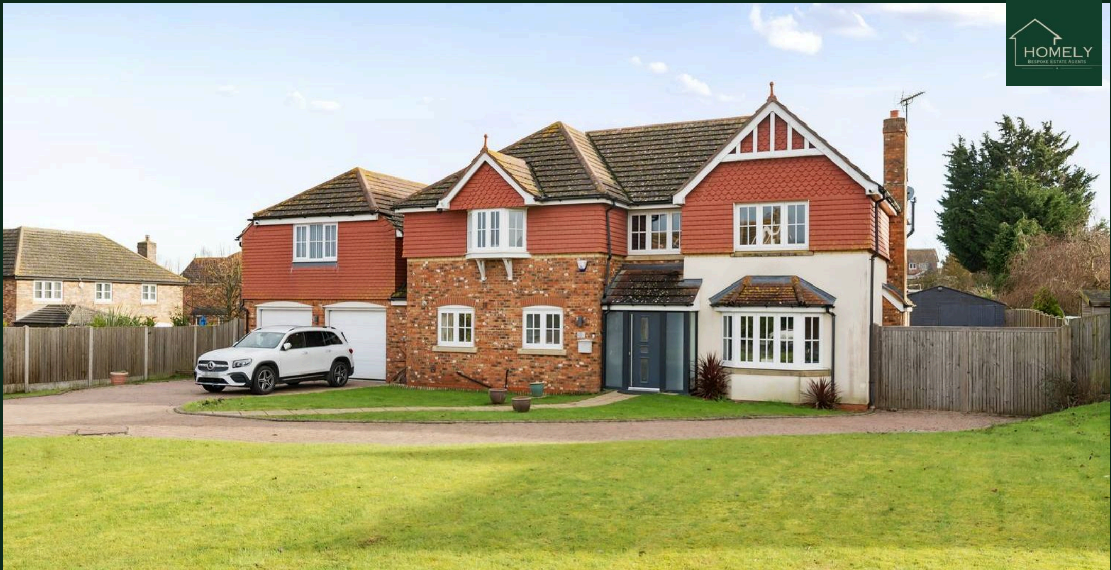
2 Oak Tree Close, Eastchurch Sheerness