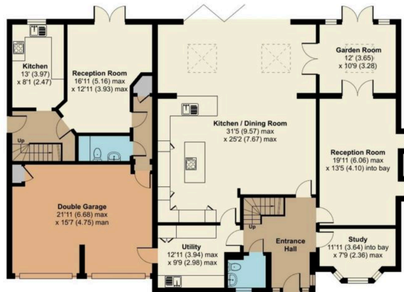
ANNEXE GROUND FLOOR / GROUND FLOOR