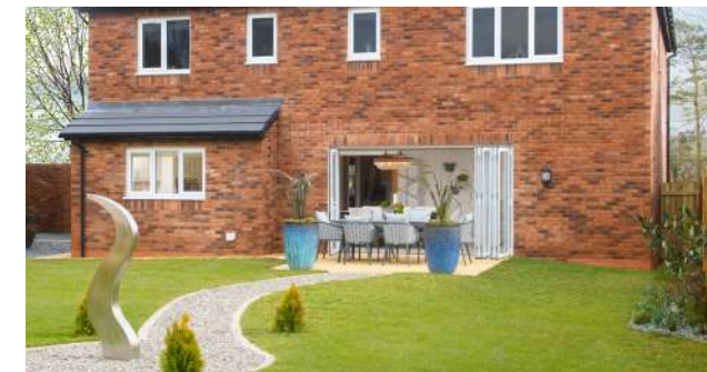
Larger gardens and paved patio areas