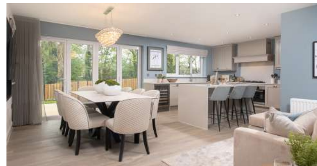
Open plan flexible living