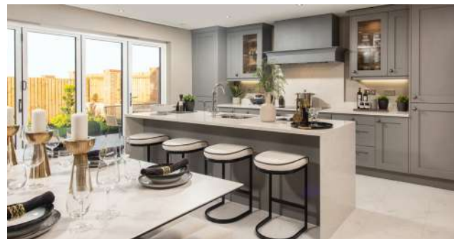
Designer kitchens with bi-fold or French doors