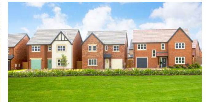
Beautiful street scenes