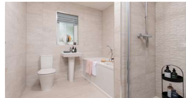
Porcelanosa bathroom tiles