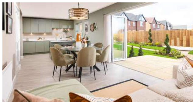
Designer kitchens with bi-fold or French doors