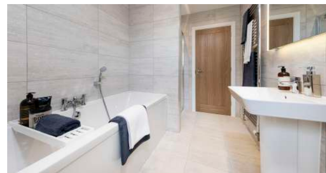
Porcelanosa bathroom tiles