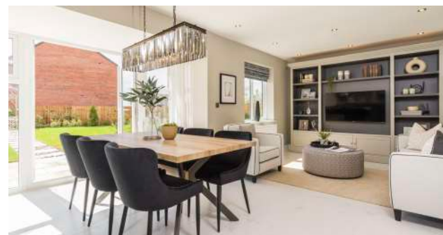
Open plan flexible living