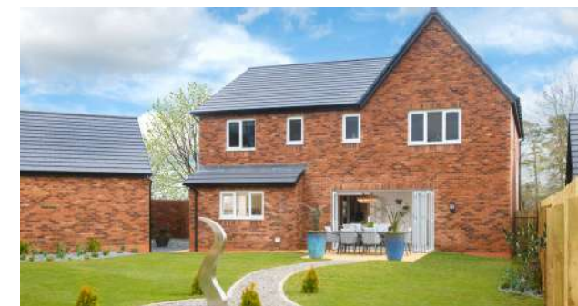
Larger gardens and paved patio areas