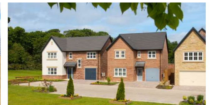
Beautiful street scenes