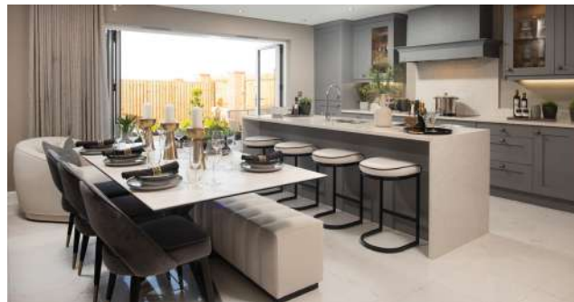
Designer kitchens with bi-fold or French doors