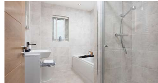
Porcelanosa bathroom tiles