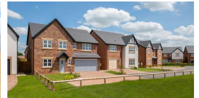
Beautiful street scenes