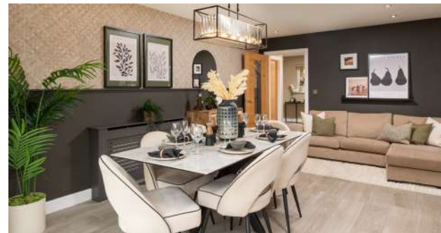
Open plan flexible living