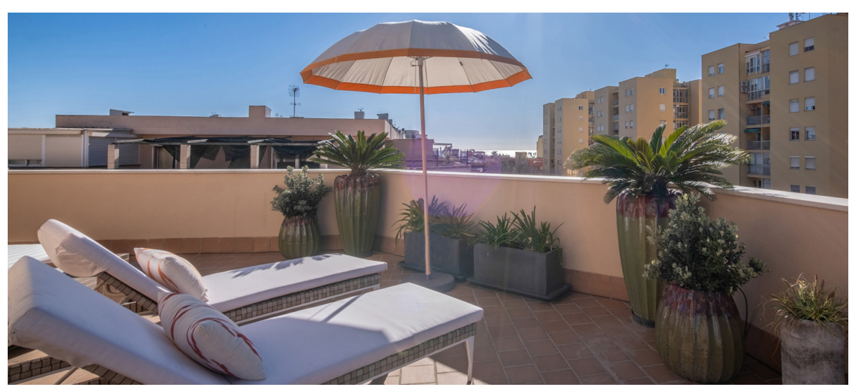
Note! The information on the property is based on the details passed to us by the vendors, the accuracy of this data will be checked before the contract is concluded by a current registration statement.

Located just steps away from the seafront promenade, this penthouse not only offers a luxurious retreat but also the convenience of beachside living with cafes, restaurants, and recreational activities at your doorstep. This stunning penthouse is sold furnished and a parking space in garage is included.