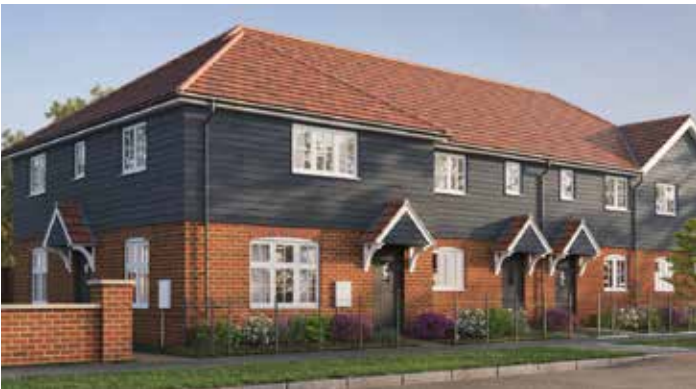
The Spey 1 Bedroom Apartment 32, 33, 40, 41, 42, 43, 50, 51