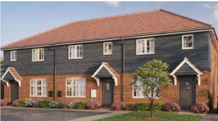
The Dart 3 Bedroom Terrace/Semi Detached 8, 9, 10, 22, 23, 29, 30, 33, 34, 35, 36, 37, 38, 39, 55, 56, 57, 58

WK - WK resident only parking VB - Visitor parking bays