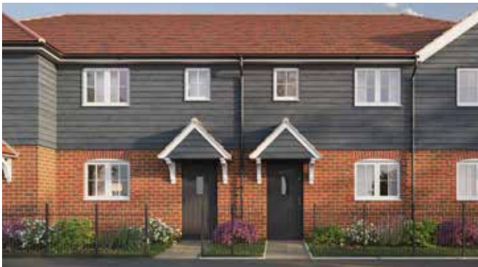
The Tavy 2 Bedroom Terrace 44, 45, 46, 47, 48, 49