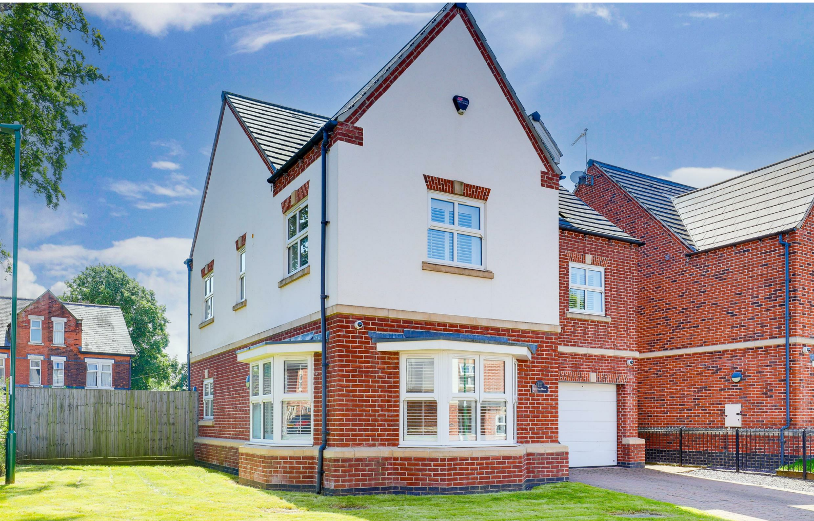
Carriage Close, Mapperley Park, Nottingham NG3 5HA