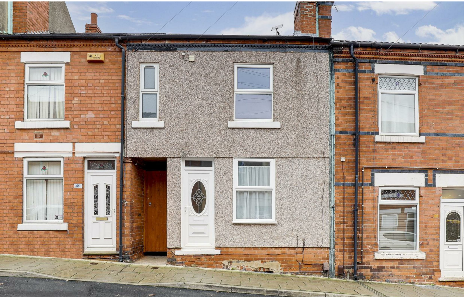
Belvoir Street, Hucknall, Nottinghamshire NG15 6NJ