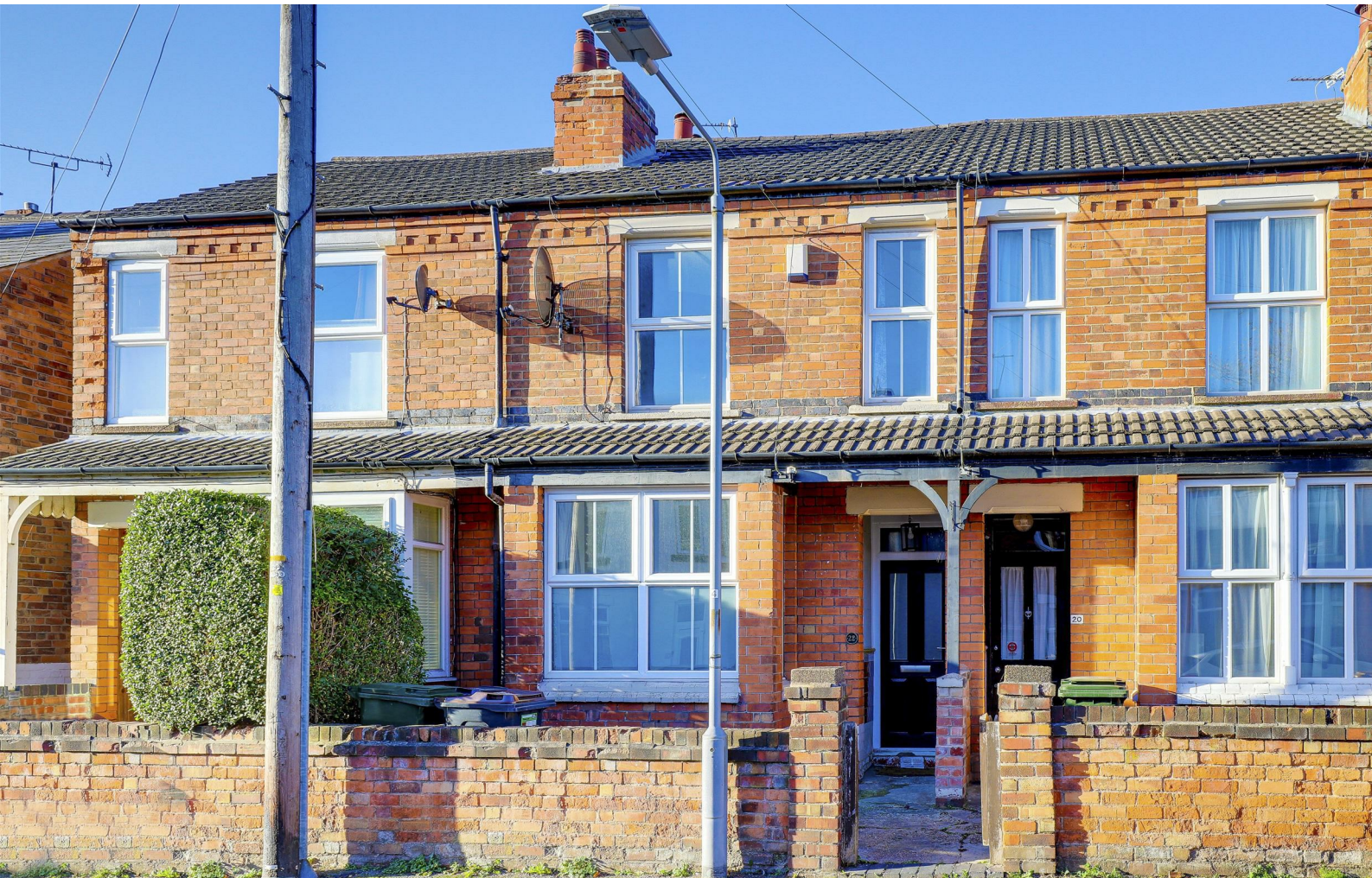
Curzon Avenue, Carlton, Nottingham NG4 1GN