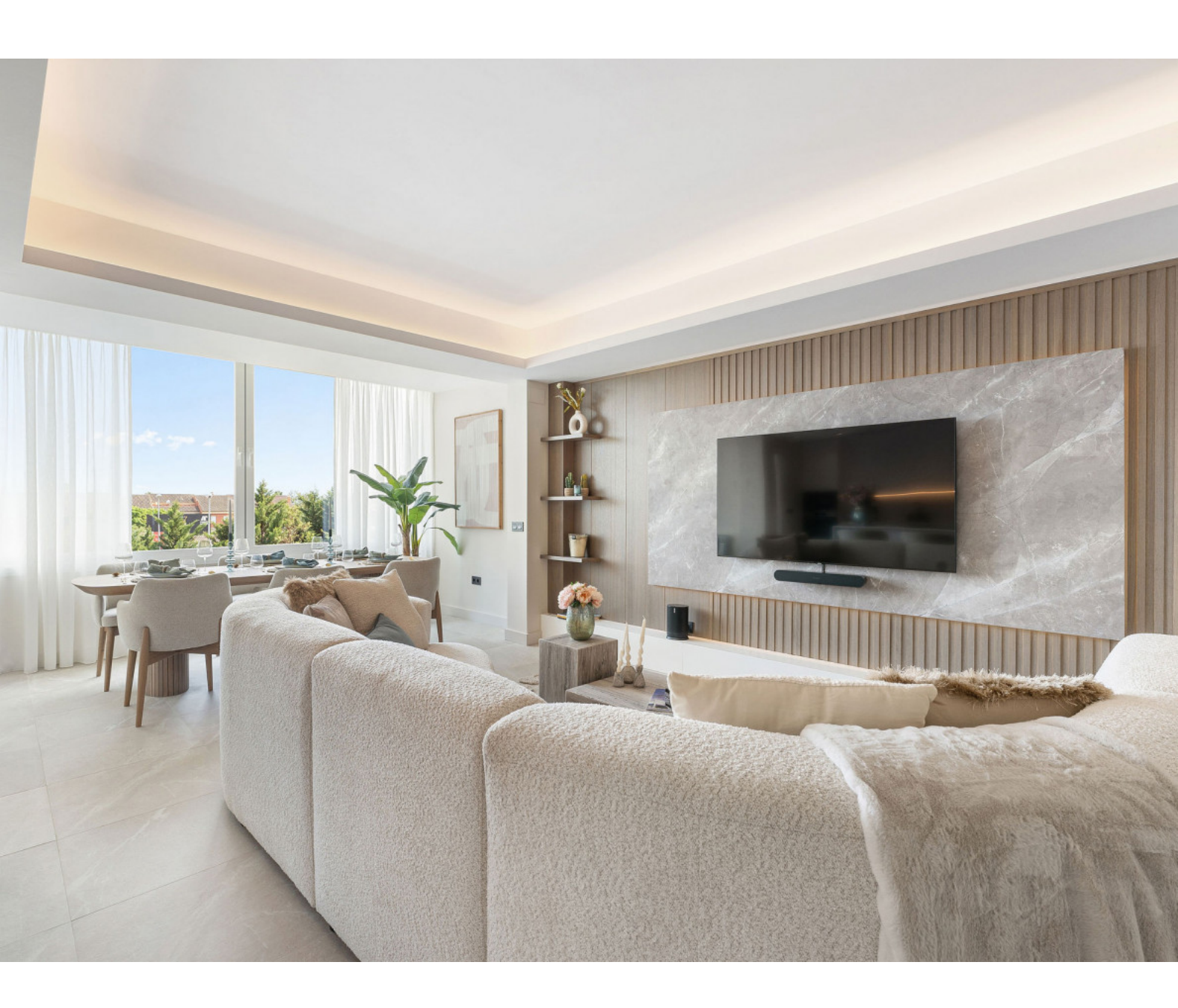
Altos del Rodeo Nueva Andalucia