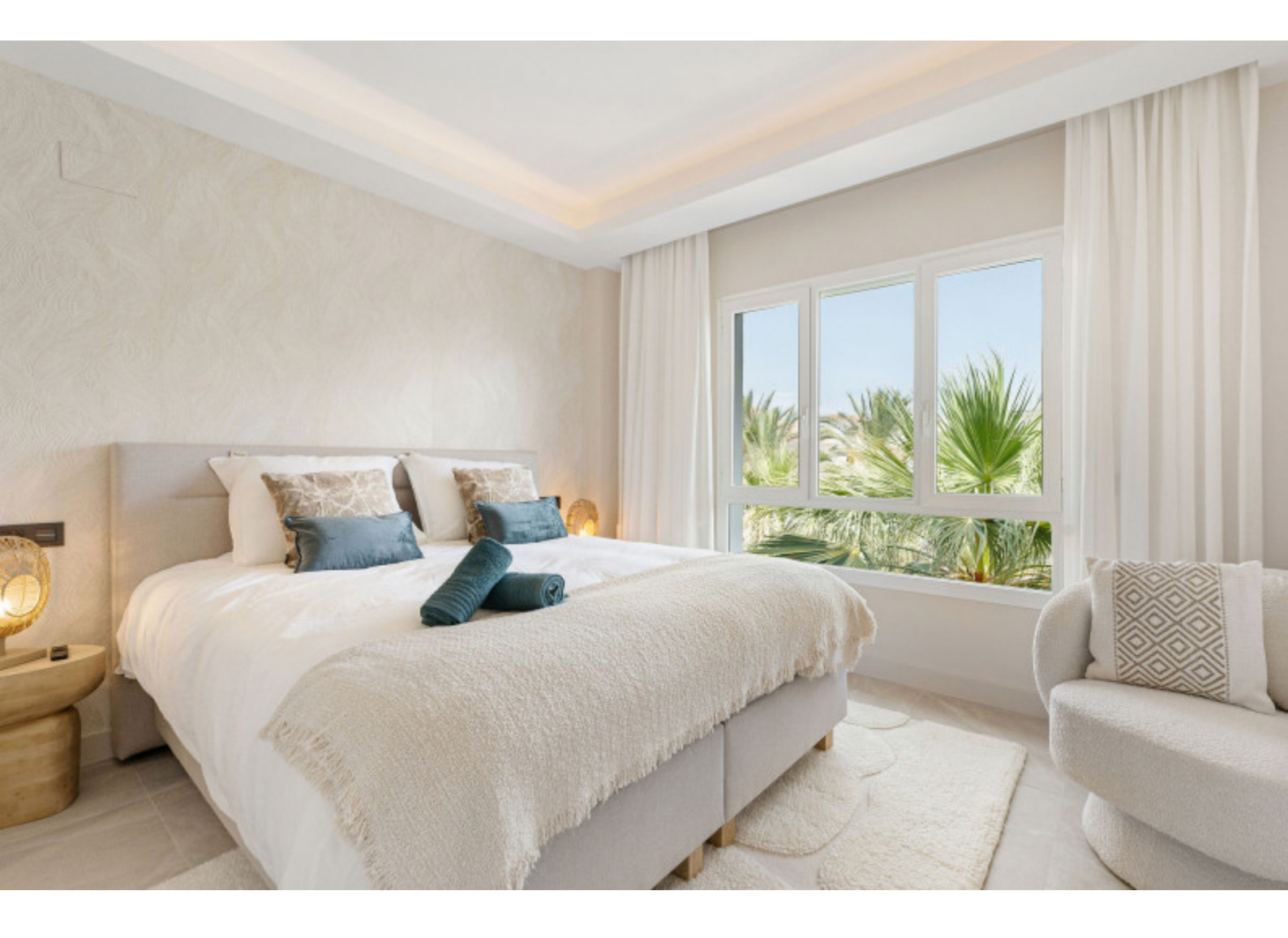
DUPLEX PENTHOUSE FOR SALE Altos del Rodeo, Nueva Andalucia