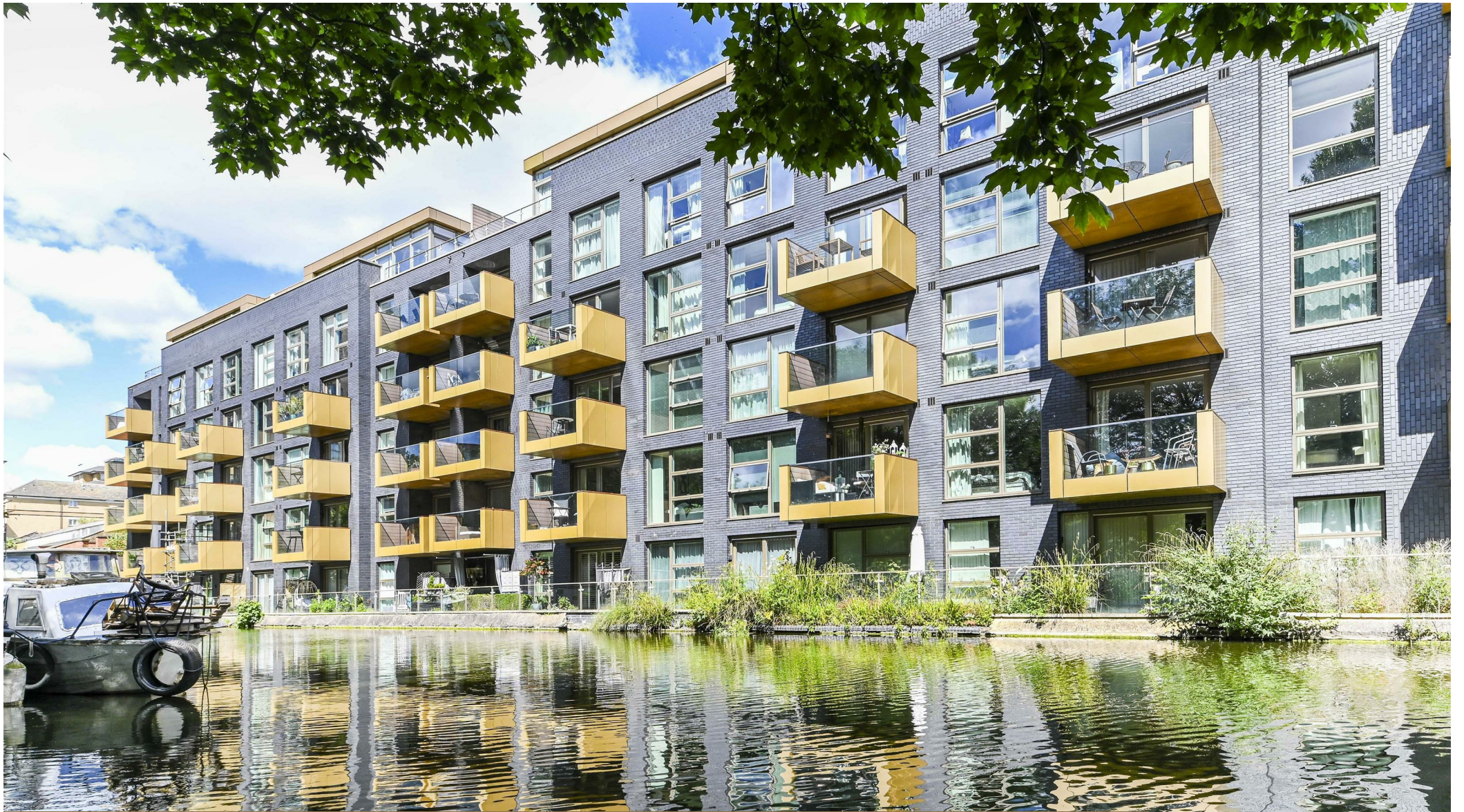
The Waterfront Apartments, Maida Vale, W9 2JY £4,400