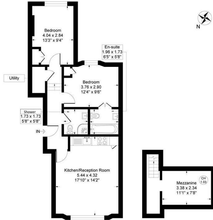
Upper Ground Floor

Illustration for identification purposes only, measurements are approximate, not to scale.