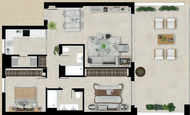
2 BED APARTMENT