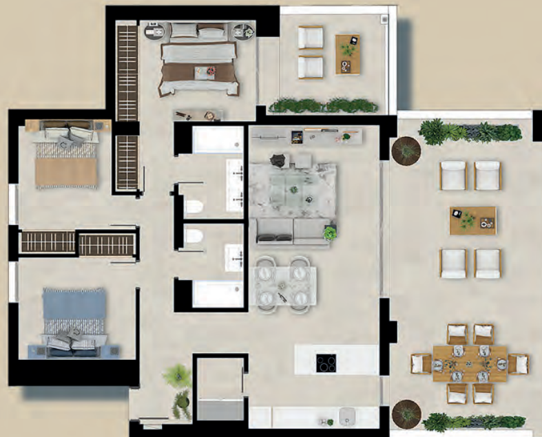
3 BED APARTMENT