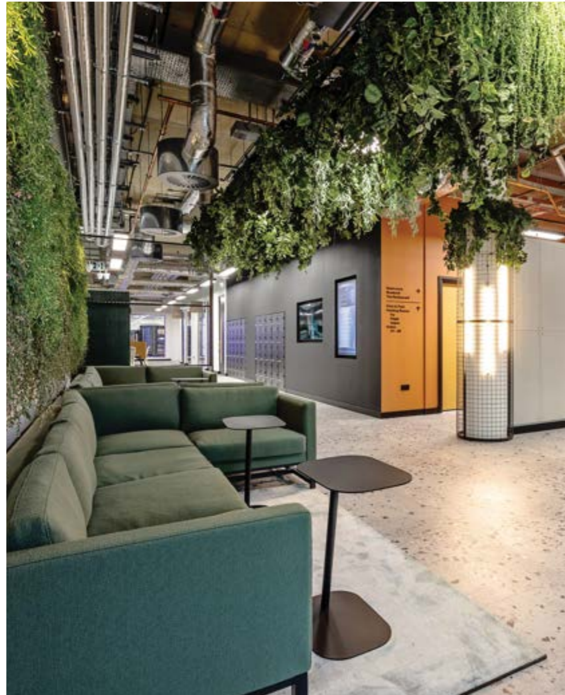
THIS IS BOTANICA