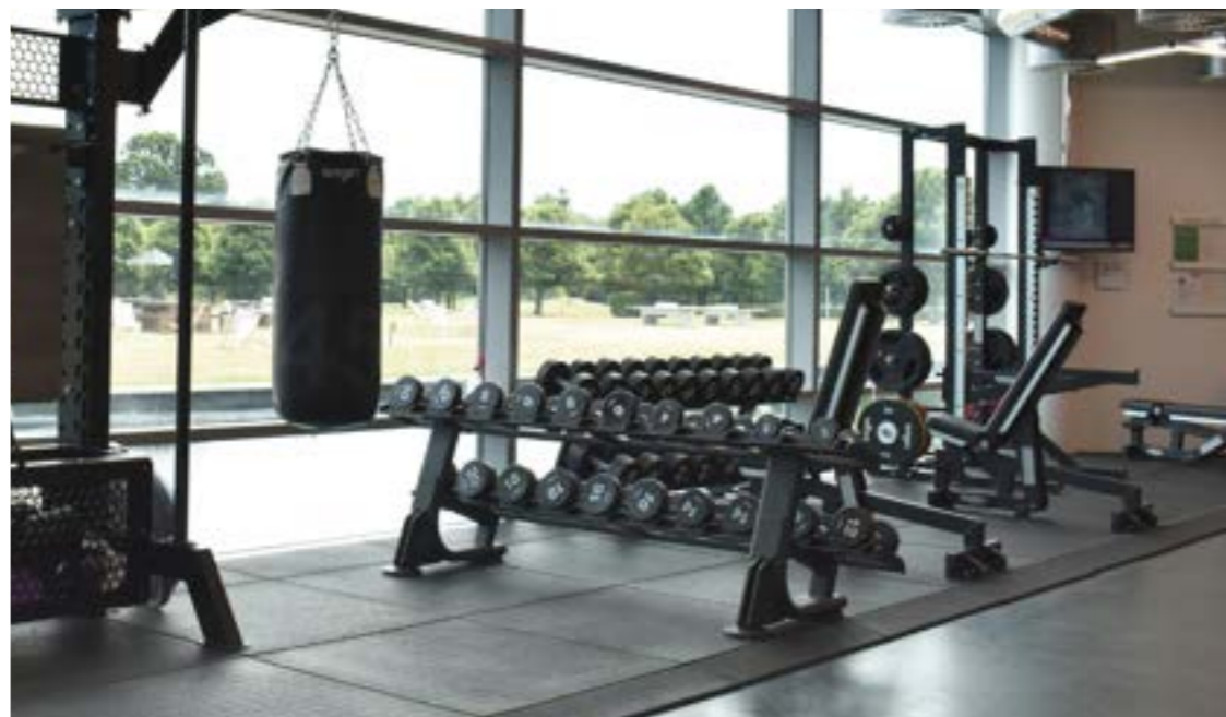
A STATE-OF-THE-ART ON-SITE GYM OPERATED BY NUFFIELD HEALTH