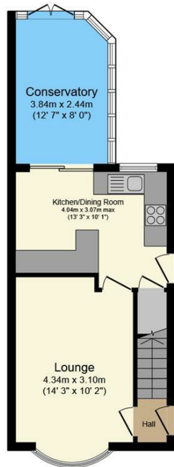
Ground Floor Floor area 39.1 m 2 (421 sq.ft.)