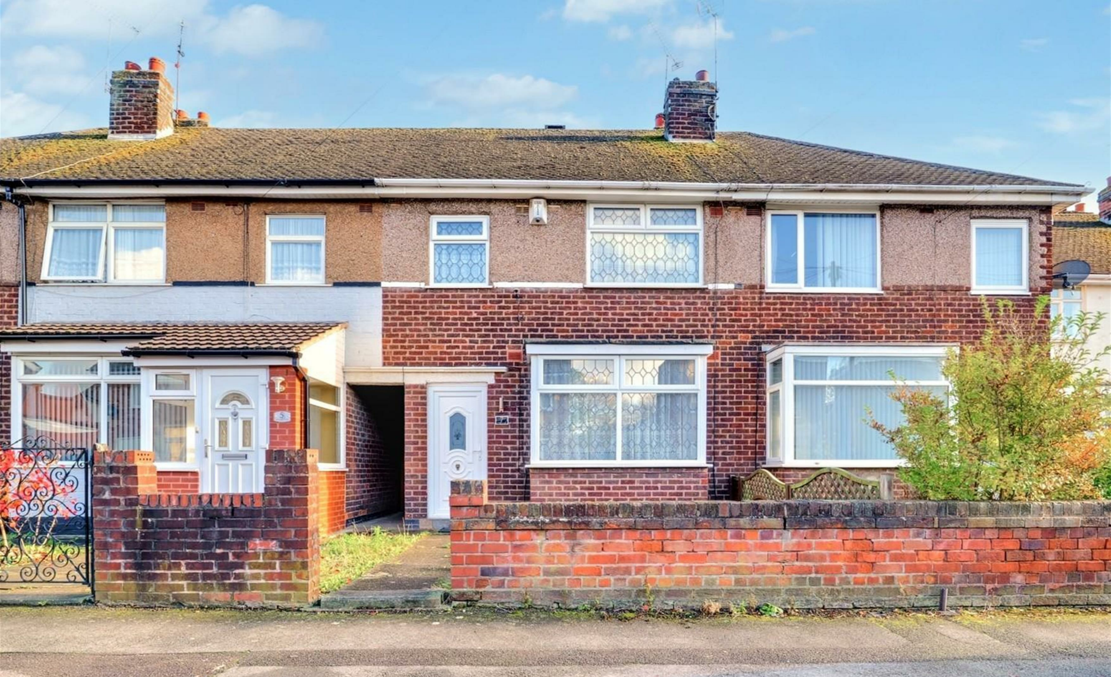
Partridge Croft, Coventry, CV6 7EY