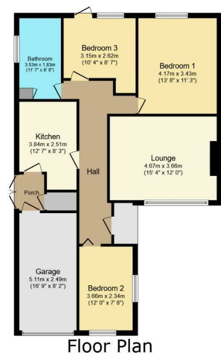
Floor area 96.2 m<sup>2</sup> (1,036 sq.ft.)

TOTAL: 96.2 m<sup>2</sup> (1,036 sq.ft.)