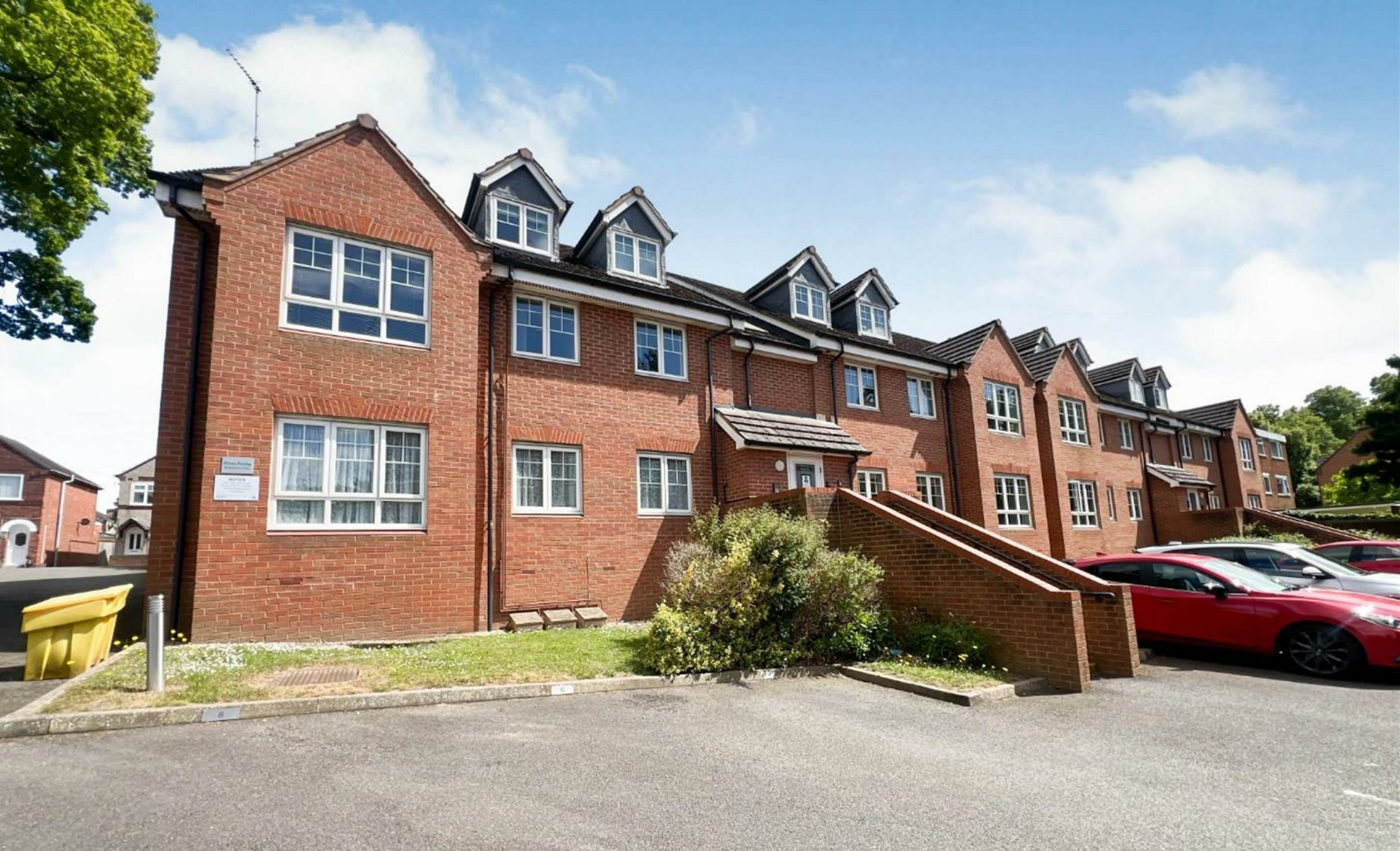
Harlequin Court, Whitley, CV3 4BF