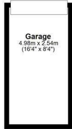
Ground Floor Approx. 57.2 sq. metres (616.1 sq. feet)