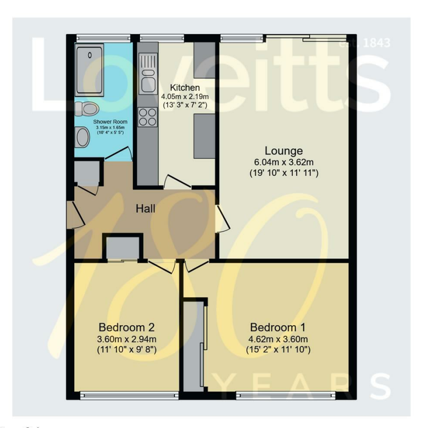
TOTAL: 74.5 m<sup>2</sup> (802 sq.ft.)

This floor plan is for illustrative purposes only. It is not drawn to scale. Any measurements, floor areas (including any total floor area), openings and orientations are approximate. No details are guaranteed, they cannot be relied upon for any purpose and do not form any part of any agreement. No liability is taken for any error, omission or misstatement. A party must rely upon its own inspection(s). Powered by www.Propertybox.io