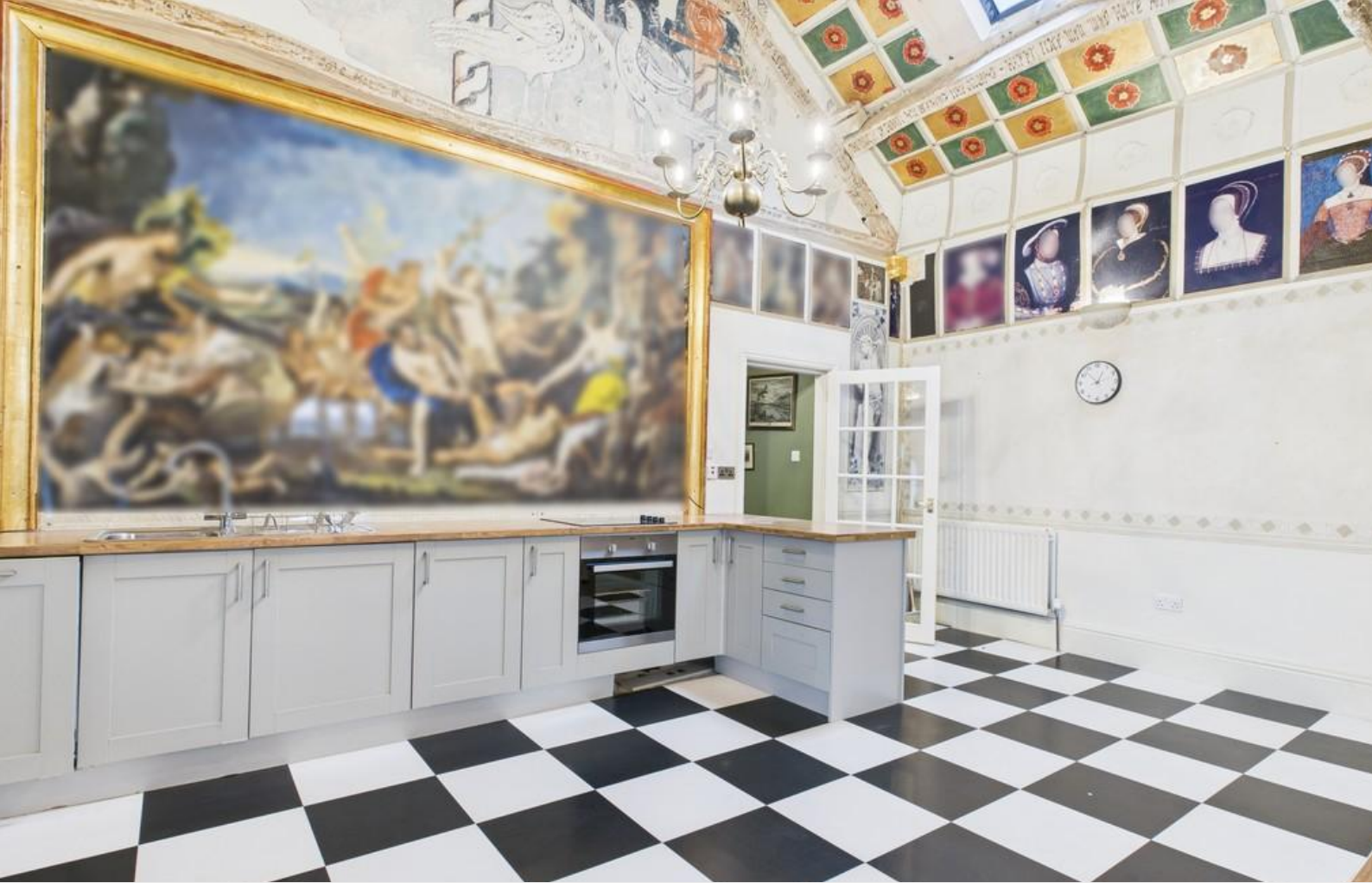
Open Plan Kitchen Living