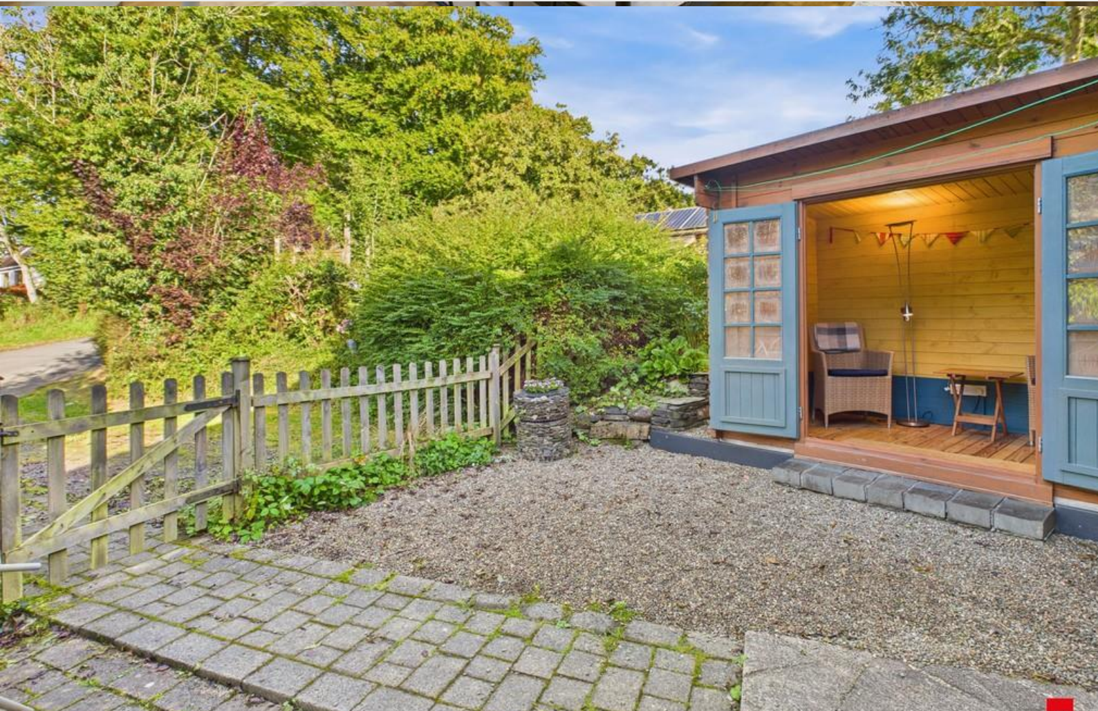
Front Patio Garden