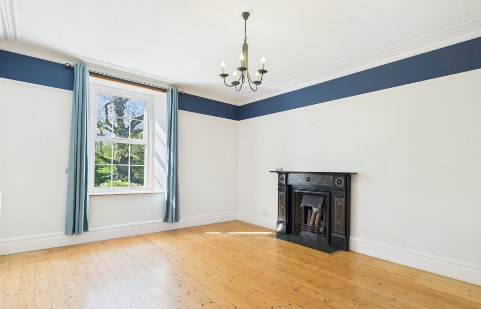
Reception Room One