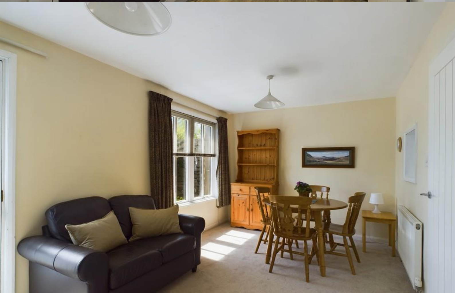
Living Dining Room