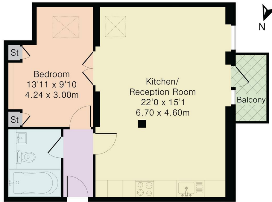
Second Floor Flat

Approximate Gross Internal Area 556 sq ft – 52 sq m