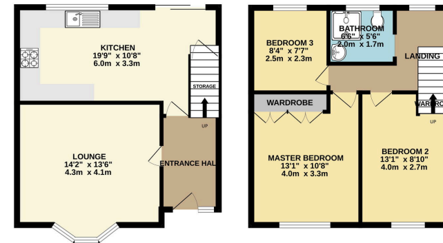
THREE BED END OF TERRACED HOUSE TOTAL FLOOR AREA: 839 sq.ft. (78.0 sq.m.) approx. While every attempt has been made to ensure the accuracy of the floorplan, the floorplan is not a guarantee of the actual dimensions of the property. The floorplan is for illustrative purposes only and should not be used as a basis for any prospective purchase. The services, systems and appliances shown have not been tested and no guarantee is made as to their condition or efficiency. See the agent for more details. Made with the design studio