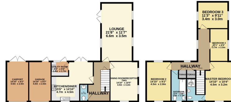
TOTAL FLOOR AREA - 1689 sq.ft. (156.9 sq.m.) approx. Whilst every attempt has been made to ensure the accuracy of the floorplan contained here, measurements of doors, windows, rooms and any other items are approximate and no responsibility is taken for any error, omission or mis-statement. This plan is for illustrative purposes only and should be used as such by any prospective purchaser. The services, systems and appliances shown have not been tested and no guarantee as to their operability or efficiency can be given. Made with Metrepro (2005).

GUIDE PRICE £575,000 - £600,000. Nestled in the highly sought-after Sachfield Drive, Chafford Hundred, this exceptional four-bedroom family home offers the perfect blend of comfort, convenience, and community spirit. Two Reception Rooms, En-Suite to Master Bedrooms, Downstairs W/C, Kitchen Diner, Utility Room and much much more. Call Zoe today to secure your viewing.