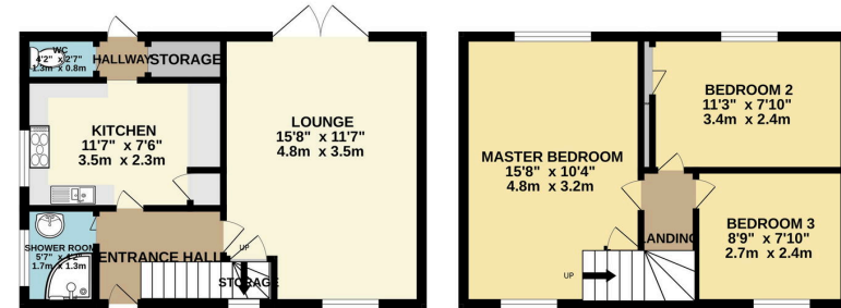
THREE BEDROOM SEMI DETACHED HOUSE TOTAL FLOOR AREA: 713 sq ft. (66.2 sq.m.) approx. Whilst every attempt has been made to ensure the accuracy of the floorplan contained here, measurements of doors, windows, rooms and any other parts are approximate and no responsibility is taken for any error, omission or misstatement. This plan is for illustrative purposes only and should be used as a guide only. Prospective purchaser. The services, systems and appliances shown have not been tested and no guarantee as to their operability or efficiency can be given. Made with floorplan 12005

Guide Price £350,000 - £375,000. NO ONWARD CHAIN. We are thrilled to present this spacious Three Bedroom Semi Detached Property in Church Crescent, South Ockendon. Large Rear Garden and enormous amounts of potential. DO NOT MISS OUT.