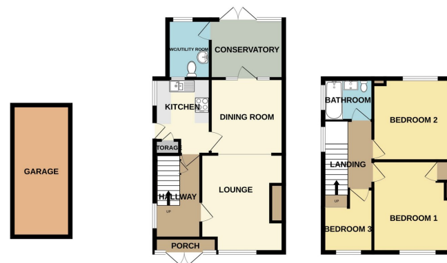
THREE BEDROOM SEMI DETACHED HOUSE TOTAL FLOOR AREA - 1044 sq.ft. (97.0 sq.m.) approx. While every attempt has been made to ensure the accuracy of the description contained here, measurements of doors, windows, rooms and any other items are approximate and no responsibility is taken for any error, omission or misstatement. This plan is for illustrative purposes only and should be used as such by any prospective purchaser. The services, appliances and appliances shown have not been tested and no guarantee as to their accuracy or efficiency can be given. Made with Housify 1/2024

GUIDE PRICE £375,000 - £400,000 - CALLING ALL FIRST TIME BUYERS, We are thrilled to introduce to the market this gorgeous and perfectly maintained Three Bedroom Semi Detached House. With Off Street Parking, Garage, Utility Room and Downstairs W/C, Rear Garden with Decking Area and much more. This house really is ticking a lot of boxes and is the ideal family living space. Do not miss your chance to view this amazing property, contact us today to book your appointment.