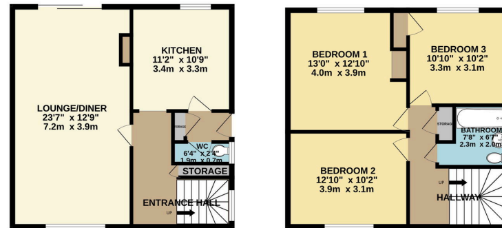
TOTAL FLOOR AREA: 1101 sq.ft. (102.3 sq.m.) approx. Whilst every attempt has been made to ensure the accuracy of the floorplan contained here, measurements of doors, windows, rooms and any other items are approximate and no responsibility is taken for any error, omission or mis-statement. This plan is for illustrative purposes only and should be used as such by any prospective purchaser. The services, systems and appliances shown have not been tested and no guarantee as to their operability or efficiency can be given. Made with Metropac CC024

SOUGHT AFTER LOCATION! SEMI DETACHED! THREE DOUBLE BEDROOMS! AMPLE OFF STREET PARKING! This wonderful property has been lovingly cared for by the same amazing family for 38 years. In the desirable street of Humber Avenue, South Ockendon, located perfectly to local school, shops and amenities. Properties here rarely become available, do not miss your chance to make this house your home. Call Zoe today on 01708203232.