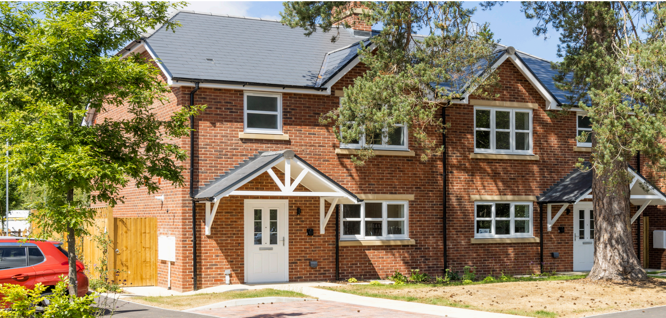
Dahlia Cottage, Ascot