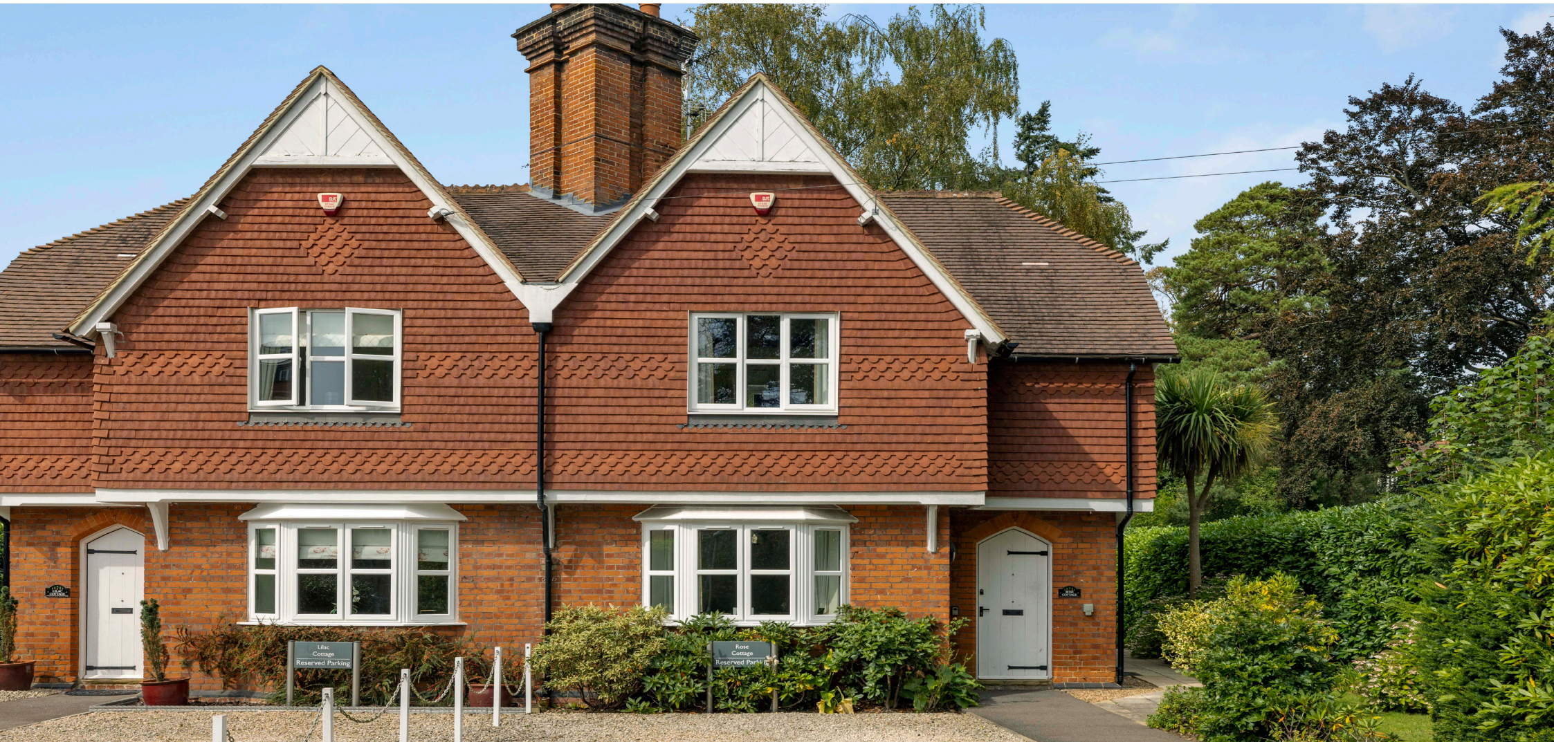
Augustus House, Virginia Water