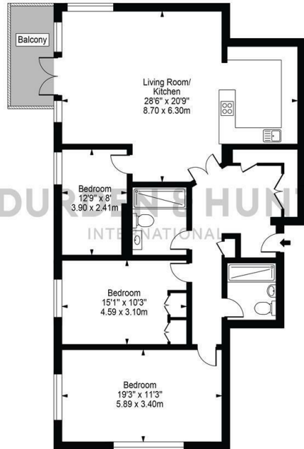
Fourth Floor For Illustration Purposes Only - Not To Scale

This floor plan should be used as a general outline for guidance only and does not constitute in whole or in part an offer or contract. Any intending purchaser or lessee should satisfy themselves by inspection, searches, enquiries and full survey as to the correctness of each statement. Any areas, measurements or distances quoted are approximate and should not be used to value a property or be the basis of any sale or let.