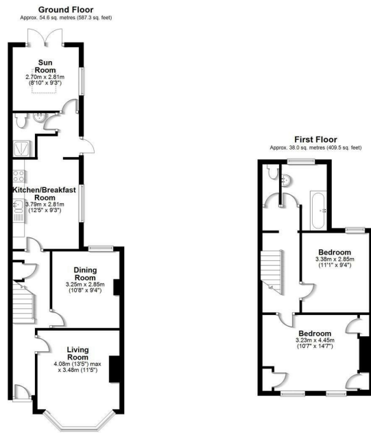
Total area: approx. 92.6 sq. metres (996.8 sq. feet)