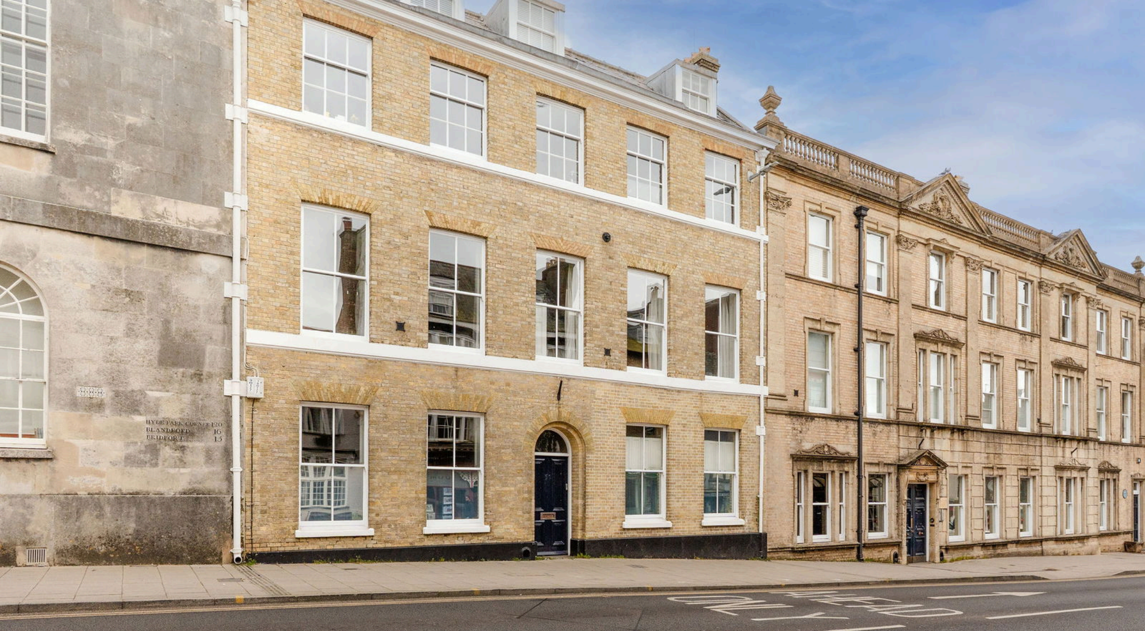
Stratton House 59-60 High West Street,