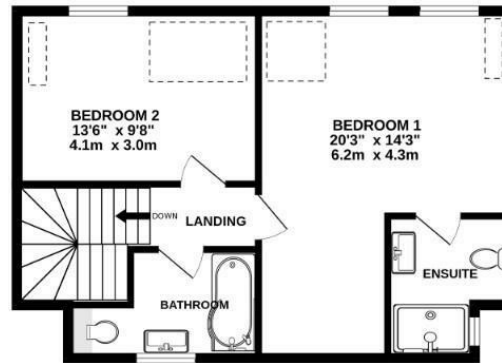
1ST FLOOR 525 sq.ft. (48.8 sq.m.) approx.