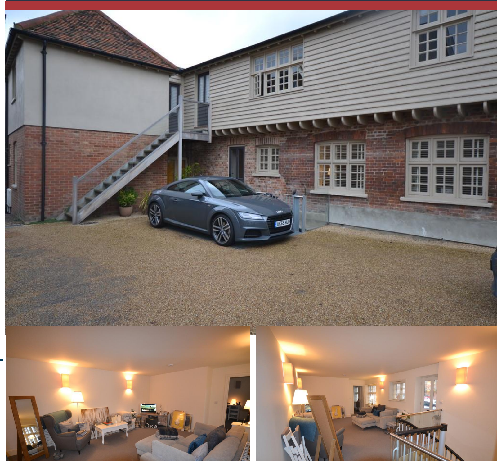
No.3 Sun Court, 59 Gold Street, Saffron Walden Essex, CB10 1EJ