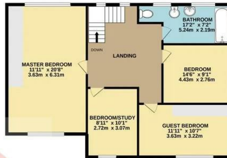
1ST FLOOR 1076 sq.ft. (99.9 sq.m.) approx.