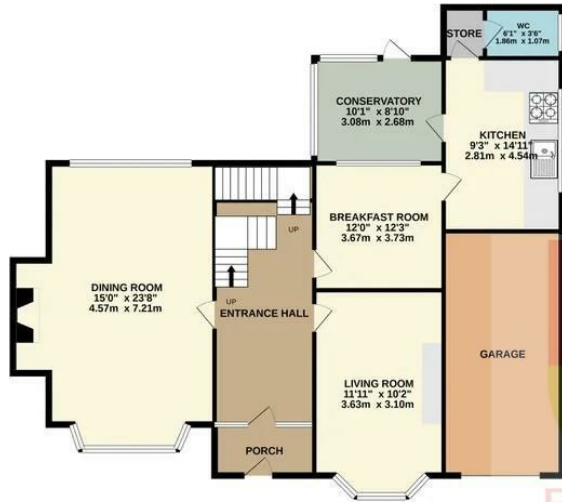
GROUND FLOOR 1542 sq.ft. (143.2 sq.m.) approx.