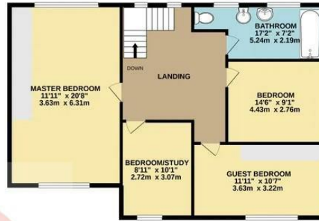
1ST FLOOR 1076 sq.ft. (99.9 sq.m.) approx.