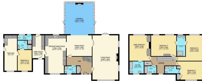
Ground Floor Floor area 187.2 m 2 (2,015 sq.ft.)